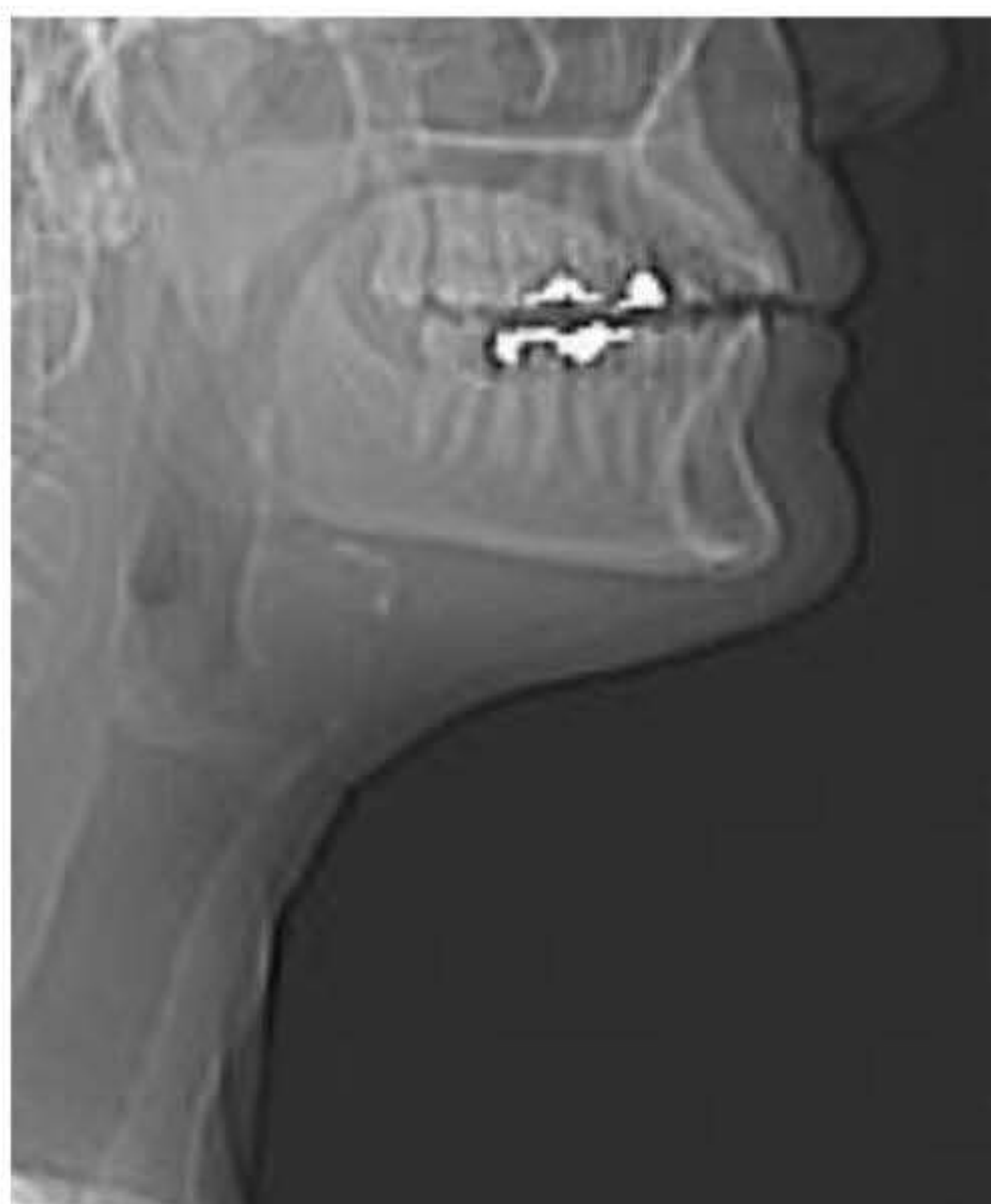
/u/ phonation without LV tube