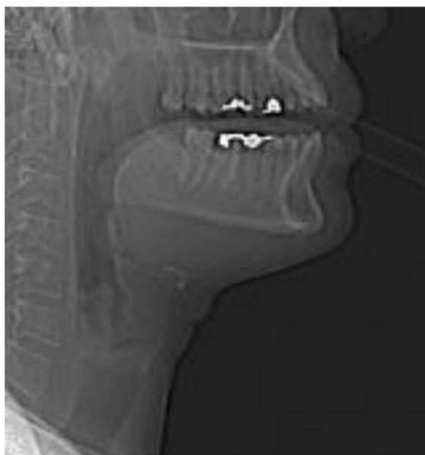
/u/ phonation with the LV tube